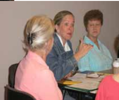
Introductory workshop, Centering Prayer