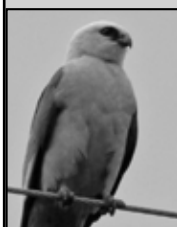
Mississippi Kite