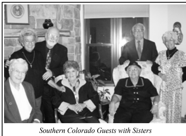
Southern Colorado Guests with Sisters