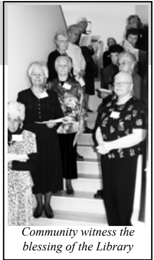
Community witness the blessing of the Library

The building expresses the significance of community life nourished by communal prayer and common meals. The chapel and dining room are the focal points with spectacular views of Pikes Peak and the forest. The living areas, library, ministry center and administrative offices join the chapel and dining area in the flow of our Benedictine motto "Ora et labora," Prayer and work.