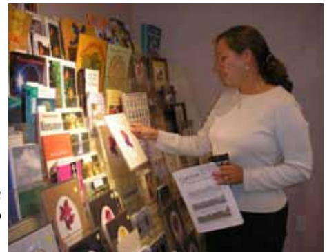
A guest browses in Benet Gift shop