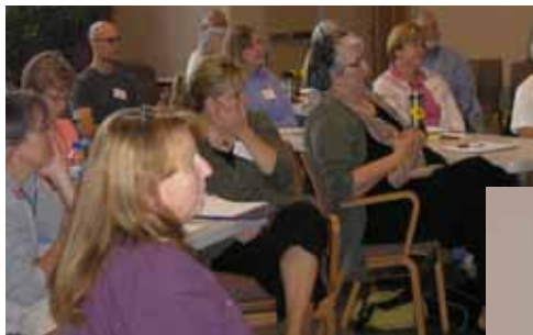
Opening workshop Benedictine Spiritual Formation Program